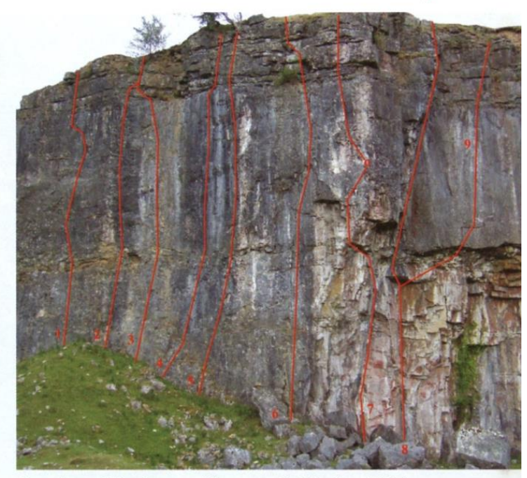
Chwar Pany-y-Rhiw: Passage of Time

Please note that there are conditions of access laid down by the Brecon Beacons National Park Authority who manage climbing on this land and regulate group use. These are set out on signage at the car-park and no-