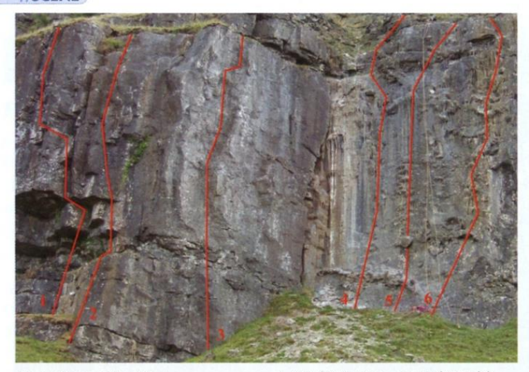
Chwar Pany-y-Rhiw, West