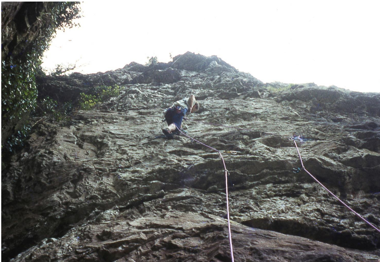
That was then..... the first ascent of Kephalonia in 1984.